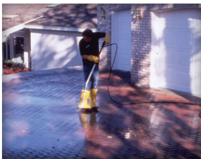
Figure 2. Pressurized cleaning equipment used by professional cleaning and sealing companies can bring out the best appearance from pavers.

Efflorescence is a whitish powder-like deposit which can appear on concrete products. When cement hydrates (hardens after adding water), a significant amount of calcium hydroxide is formed. The calcium hydroxide is soluble in water and migrates by capillary action to the surface of the concrete. A reaction occurs between the calcium hydroxide and carbon dioxide (from the air) to form calcium carbonate, then called efflorescence.