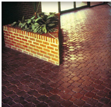
Figure 1. Many sealers enhance the appearance of concrete pavers and protect against staining.

Commercial stain removers available specifically for concrete pavers provide a high degree of certainty in removing stains. Many kinds of stains can be removed while minimizing the risk of discoloring or damaging the pavers. The container label often provides a list of stains that can be removed. If there are questions, the supplier should be contacted for help with determining the effectiveness of the chemical in removing specific stains.