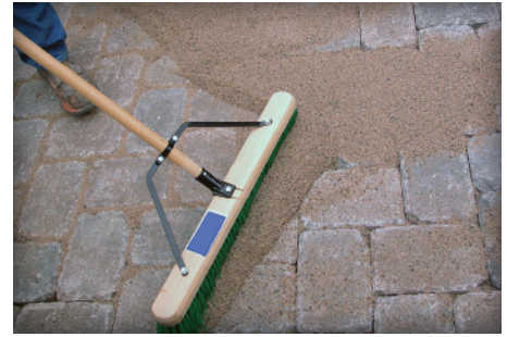
Figure 5. Joint sand can be pre-mixed and delivered to the site (typically in bags), or mixed with stabilizer at the site, then swept into the joints, compacted for consolidation in them to create interlock, and wetted to activate the stabilizer.

of silts or other fines working their way into spaces between the sand particles. The rate of stabilization depends on the amount and sources of traffic, plus sources of fines that work their way into the joints from traffic over time.