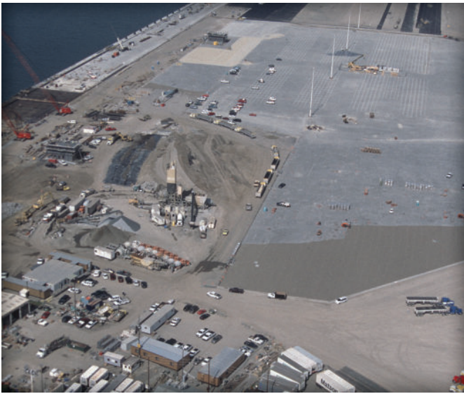
Figure 14. The Port of Oakland, California, is the largest mechanically installed project in the western hemisphere at 4.7 million sf (470,000 m 2 ).

the paver installation subcontractor moves to another area of a large site, or completes the job and leaves, he has no control over protection of the pavement. Therefore the GC should assume responsibility for protecting the completed work from damage, fuel or chemical spills. If there is damage, it should be repaired to its original condition, or as directed by the engineer. When the job is completed, all equipment, debris and other materials are removed from the pavement.