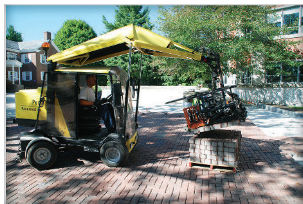
Figure 1. Mechanical installation of interlocking concrete pavements (left) and permeable units (right) is seeing increased use in industrial, port, and commercial paving projects to increase efficiency and safety.