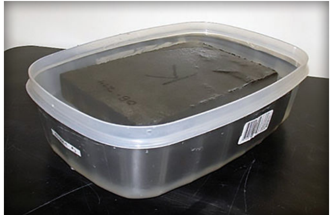
Figure 3. Test specimen from a slab immersed in a 3% saline solution ready for exposure to laboratory freeze-thaw cycles.

To emphasize differences in their ability to receive repeated vehicular loads, compare the total number of lifetime 18,000 lb. (80 kN) equivalent single axle loads (ESALs) in the base thickness design tables in CMHA Tech Note PAV-TEC-004—Structural Design of Interlocking Concrete Pavement to those in this bulletin. This Tech Note provides structural designs up to 10 million ESALs whereas the maximum in this bulletin for paving slabs and planks is 30,000 ESALs. This indicates that paving slabs and planks are exposed to limited vehicular traffic, and especially a limited number of trucks.