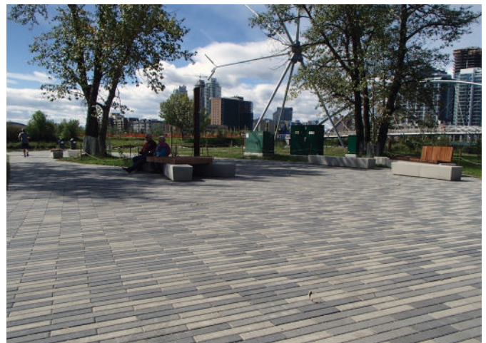
Figure 1. Concrete paving slabs can create certain moods and enhance the character of a project.