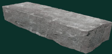
Rockface Side 48" L x 15" D x 7" R