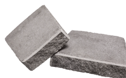
Ancestral - 2 Piece Set 3.63" h x 16/13" l x 13" d 3.63" h x 13/10" l x 13" d