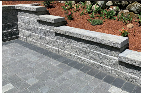
CASTSTONE™ ROCKFACE COPING