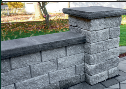
8" BULLNOSE COPING SINGLE & DOUBLE SIDED