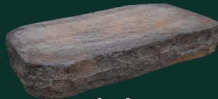
Step B 48" L x 25" D x 7" H