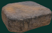
Step C 28" L x 25" D x 7" H

Available in three sizes and shapes, each step is cast in molds that carefully replicate the textures, colors and detail of natural stone. Features a 7" rise. Each offers consistent size, height and texture, saving time when selecting and installing.