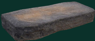
Step A 54" L x 25" D x 7" H