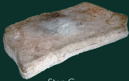
Step C 48" L x 18" D x 7" H