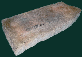
Step A 42" L x 18" D x 7" H