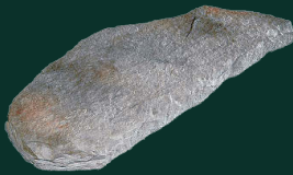
Step F 60" L x 18" D x 7" H

Available in several sizes and shapes, each step is cast in molds that carefully replicate the textures, colors and detail of natural stone. Features a 7" rise, each offers consistent size, height and texture, saving time when selecting and installing.