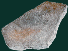
Step D 54" L x 24" D x 7" H