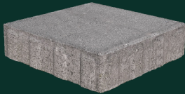
2 pcs/set 11" W x 11" L x 2.75" H

Our Andover Collection pavers offer a choice of profiles and finishes in traditional shapes scaled to complement the trend for larger paving units. Interchange styles and sizes to create a variety of eye-catching patterns, textures and details.