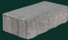
2 pcs/set 5.5" W x 11" L x 2.75" H