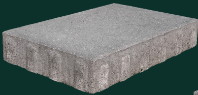
1 pc/set 11" W x 16.5" L x 2.75" H